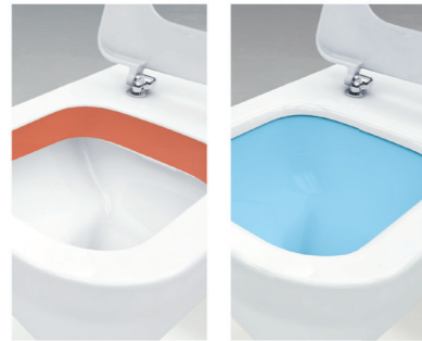
With traditional box-rimmed toilets, approximately 20% of the bowl is unwashed.

With AquaBlade® technology, the optimised water pressure and smooth curves of the bowl flush bacteria clean away with no unhygienic splashing. The bowls are also very easy to clean, with no overhanging rim to hide potentially dirty areas.